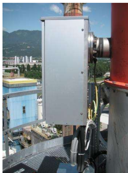
Sampling unit installation