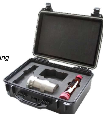
Sampling support carrying case